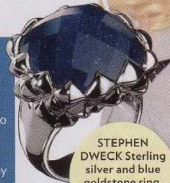
STEPHEN DWECK Sterling silver and blue goldstone ring, $350; 888-888-4757