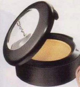
M.A.C Eye Shadow in Gorgeous Gold, $14; maccosmetics.com