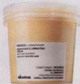
DAVINES NouNou hair conditioner, $22; davines.com for salon locations

SHOES "The YSL Tribute. I just got them in leopard." JEWELRY "I build outfits around Stephen [Dweck]'s pieces. They're quite the statement." VACATION SPOT "I take annual trips to Japan because I love it so much. Tokyo and Kyoto." CD "I'm in babyland, so I'm very into CDs from Rockabye Baby. They make lullaby versions of everything from the Beatles to Radiohead."